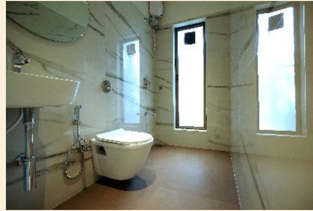
Actual Photos of Show Flat